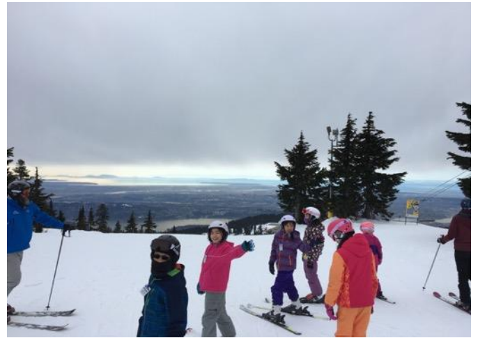
Last Ski Day for Gr. 5s