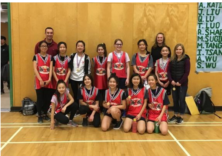
Burnett Breaker Basketball Tournament