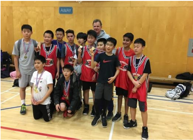
Burnett Breaker Basketball Tournament