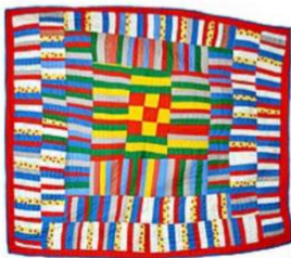
a 1979 quilt by Lucy Mingo of Gee’s Bend, Alabama. It includes a nine-patch center block surrounded by pieced strips.

Euna: They are like First Nations button blankets!