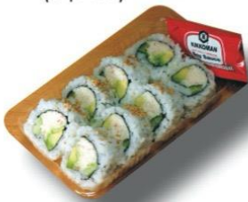
California Roll (8pcs)