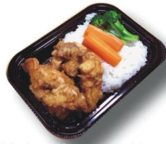
Chicken Karaage (4pcs) with Rice $7.50