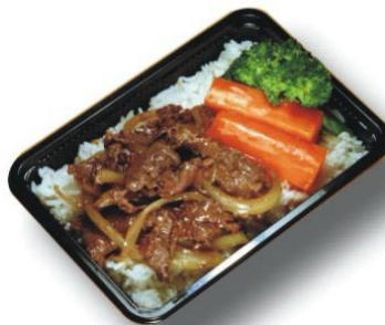
Teriyaki Beef on Rice