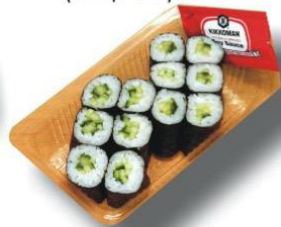
Cucumber Maki (12pcs)