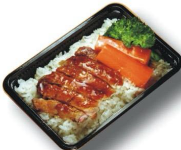
Teriyaki Chicken on Rice