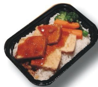
Teriyaki Tofu on Rice