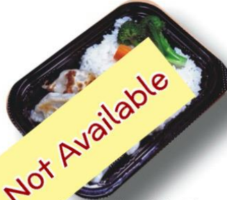
Gyoza (4pcs) with Rice