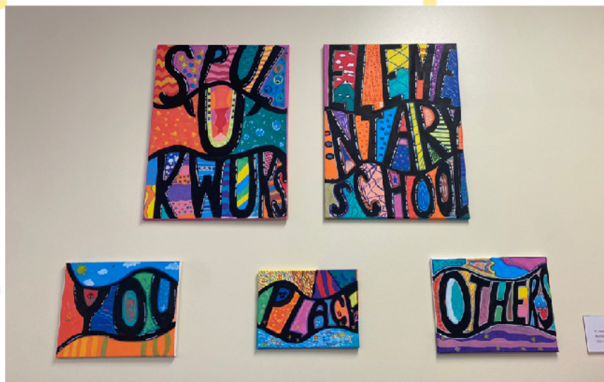
BEAUTIFUL ART COLLABORATION MADE FOR THE LIBRARY BY OUR GRADE 6 AND 7 STUDENTS